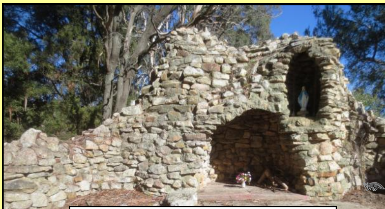
The Grotto provides a peaceful sanctuary and a sheltered meeting place for 'Secret Men's Business'