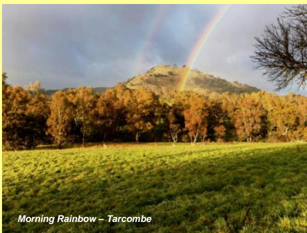
Morning Rainbow – Tarcombe

We live in a community that is close enough to Melbourne that we can work there and live in the hills, for most of us the solitude and remoteness so close to the rat race is one of this area's greatest attractions. However for many who live here all the time, the solitude can also eat you alive when the going gets tough..... that's when the true charm of this area comes forward.