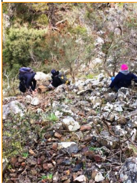
The Scramble Down !