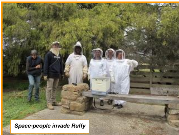
Space-people invade Ruffy