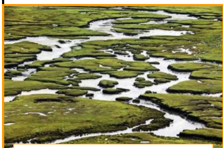
The 'Mucky Mire' - pristine undrained Irish bog lands