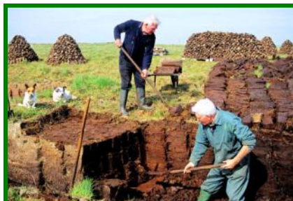
Modern-day peat harvesting in Ireland.