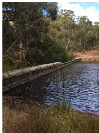
Trawool Weir a top lunch spot