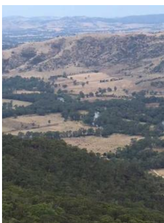
Trawool Valley from Warrigal Rocks