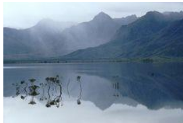
Lake Pedder—Olegas Truchanas