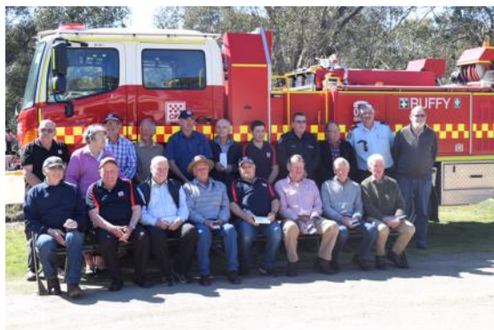
Ruffy Rural Fire Brigade CFA Service Award Recipients