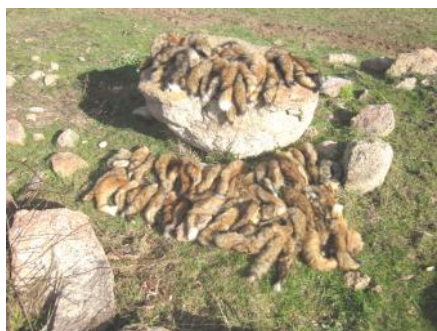
Just in case you were wondering what a large number of fox tails all together looked like, here it is! Thanks Simone for the photo!