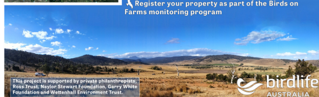
This project is supported by private philanthropists, Ross Trust, Naylor Stewart Foundation, Garry White Foundation and Wettenhall Environment Trust.

✎ Register your property as part of the Birds on Farms monitoring program