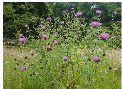
Black Knapweed in flower