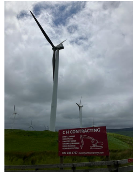
Te Apiti Windfarm - Manawatu, New Zealand

Both photos take from the Saddle Road that slices between the turbines.