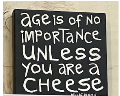
Sign seen in the Bruny Island Cheese Company's shop.