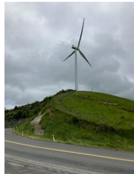
On the South side of Cherry Tree Wind Farm.

Both photos take from the Saddle Road that slices between the turbines.