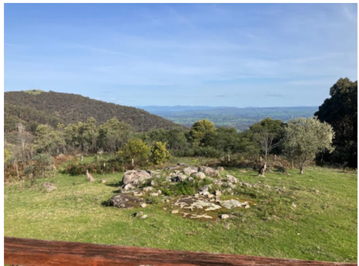
Specky view from the Roberts' front deck