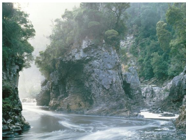
Peter Dombrovskis' stunning photo - Morning Mist, Rock Island Bend, Franklin River. The photo that 'saved' the Franklin River.