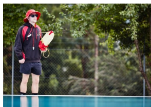
LIFEGUARD POSITIONS 2020/21 Pool Season