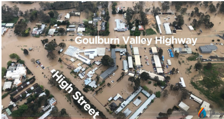
Photo - Vic Emergency - Seymour submerged by the Goulburn River- for orientation Seymour Police Station is the white-roofed complex on left-hand side

Read on for another great issue... Pauline And Kenny Koala...was wallowing in the Winter Super Mix seed.